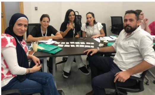
Workshops not lectures