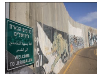
Separation Wall at Bethlehem Checkpoint

It had a profound effect on everyone and once back in UK a cheque for £5,000 was sent to the CNT for a project in a