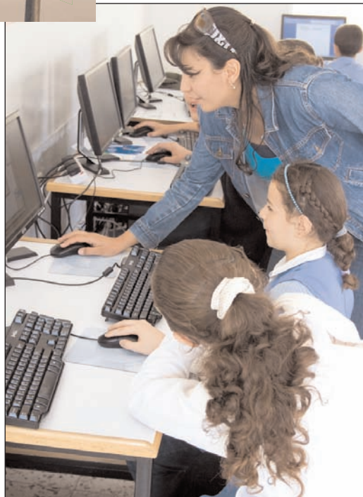
Pupils and teacher at the new computers