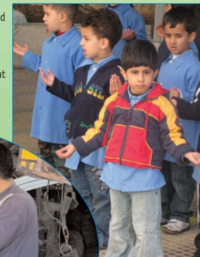
Praying the Our Father at assembly, Ajloun

This is a remarkable achievement and we are grateful to our donors both large and small who have contributed over the years. The tangible results of this can be readily seen, not only in the material educational resources, but also in the growing number of pupils who have benefited from your donations. The finance is very important, but so also is the appreciation of the pupils and staff who feel increasingly isolated and forgotten. We want to show that we will continue to care for them.