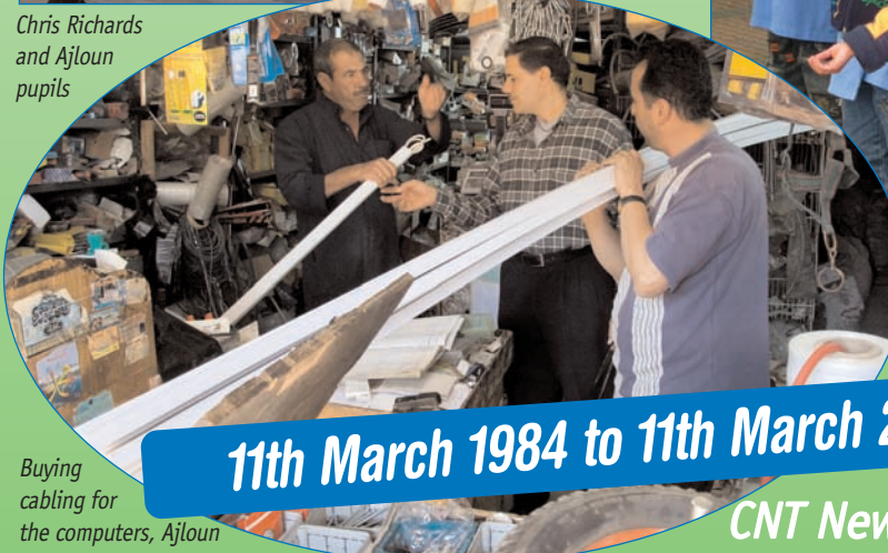
Buying cabling for the computers, Ajloun