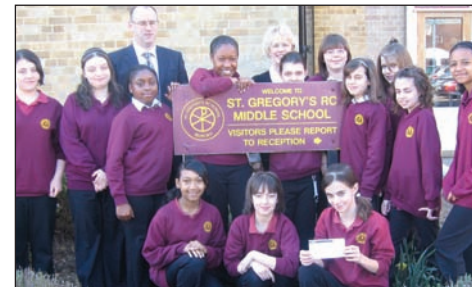
St Gregory's raise funds for Al Ashrafieh, Jordan

February 2008. Years seven and eight at St. Gregory's organised another fund raising appeal in Lent, which raised over £300. The staff and pupils at Al Ashrafieh are so grateful for their generosity of spirit, kindness and support. A laudable example of 'Children helping Children'. Well done St. Gregory's.