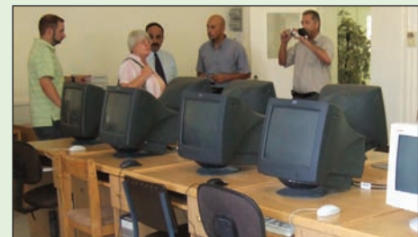
The photo above shows the computer room at Madaba Boys School funded by CNT

One of the most valuable ways of support is by twinning our Catholic schools and parishes with those in Jordan, and this is what I now try to encourage. I do hope you can help!